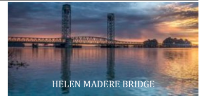
HELEN MADERE BRIDGE

"If opportunity doesn't knock, build a door." - Milton Berle