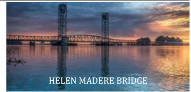
HELENE MADERE BRIDGE

It's hard to beat a person who never gives up—Babe Ruth