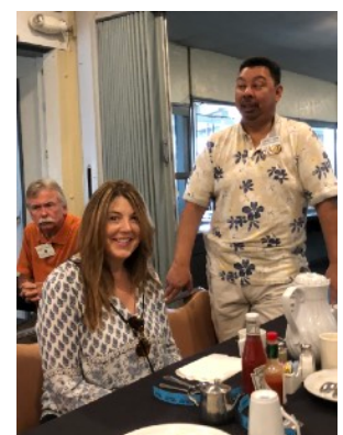
"Make Tequila Great Again-Sell.....Sell.....Sell"