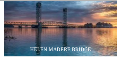
HELEN MADERE BRIDGE

"If opportunity doesn't knock, build a door." - Milton Berle