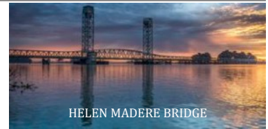
HELENE MADERE BRIDGE

"If opportunity doesn't knock, build a door." - Milton Berle