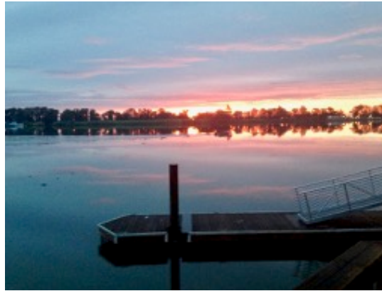
We are treated to a gorgeous sunrise as we arrive for our early morning meetings.

with a center pole. The “beds” were mats, and all water there had to be carried in from one mile away. As she wasn’t physically able to work on the water project, she focused on helping in other ways. She relates a story of helping an elderly woman who came because she wanted a new pair of the adjustable pink shoes. With her was young girl who had badly infected, maggot infested legs. The villagers were discussing the pouring of boiling water on her legs, saying that without that treatment the girls was going to die.