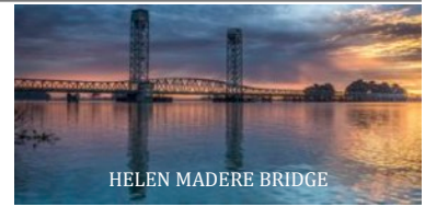
HELEN MADERE BRIDGE

"If opportunity doesn't knock, build a door." - Milton Berle