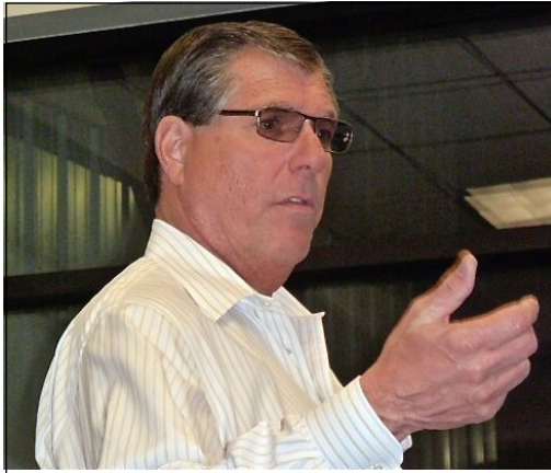
I told ya, we run a squeaky clean shop.