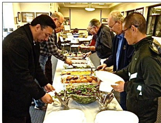
The cuisine was exquisite!

The machinery is fully automated with few break downs due to rigid maintenance procedures.