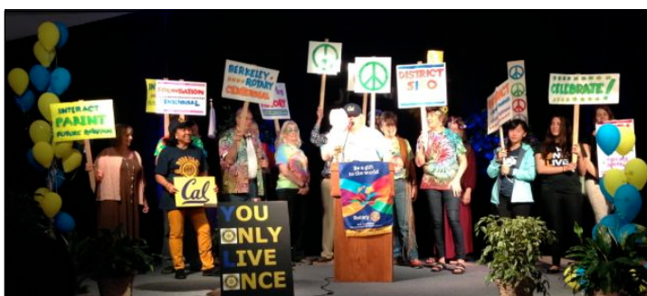
District Conference finale celebration: event organizers took over the stage with gala signs, banners and posters.

Raffle Chair Al draws own ticket; but wrong marble.