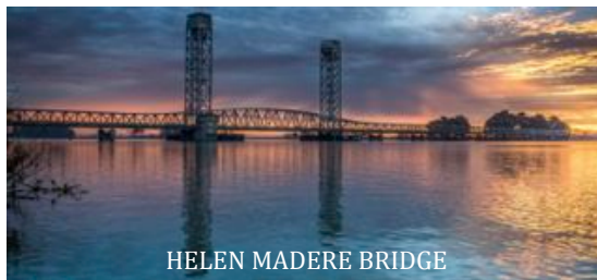
HELEN MADERE BRIDGE