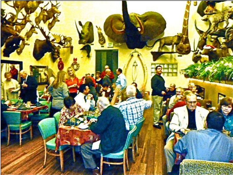
Rotarians and guests enjoy Xmas dinner at Foster's.