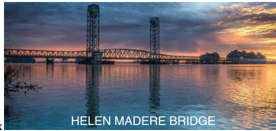
HELEN MADERE BRIDGE

Knowledge speaks, wisdom listens. Jimmy Hendrix