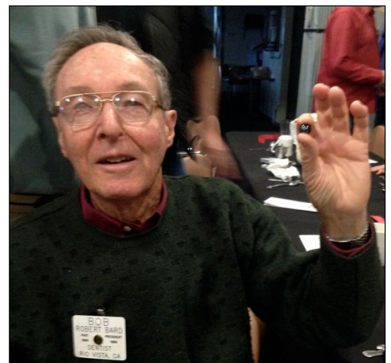
Your bulletin editor wins the raffle. Maybe he'll invest the proceeds at the lake.

traveling to Montreaux, Switzerland, to see Van Morrison, Nice, France, where they celebrate U. S. Independence Day, July 4, Switzerland, and Rome. He rode a train that travelled 220 M. P. H.