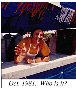
Oct. 1981. Who is it?