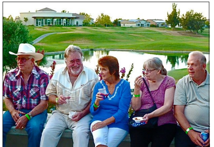
Oblivious to the confounding water hazard at the approach on #18 behind them, our guests sample their food and drink, enjoying the warm evening.