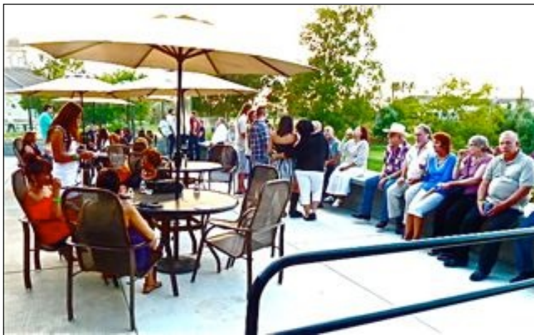
Once our guests had filled their glasses and plates, they adjourned to the patio to sit and relax in gracious comfort, conversing and sampling the many varieties of fine tequila.