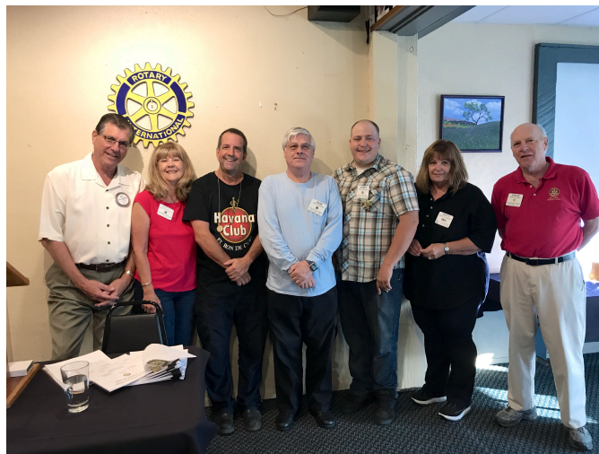
2017/2018 Rio Vista Rotary Board of Directors