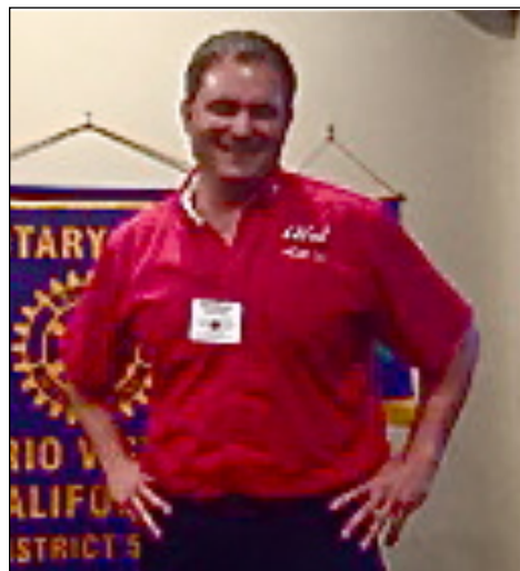
Cub suffers cellphone malfunction.