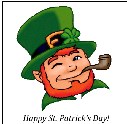
Happy St. Patrick's Day!