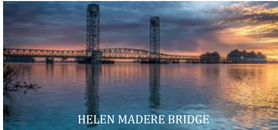
HELEN MADERE BRIDGE