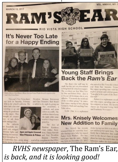
RVHS newspaper, The Ram’s Ear, is back, and it is looking good!

50/50 Raffle Lucky Jon isn’t lucky, today.