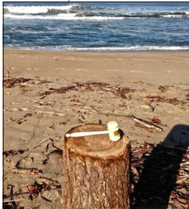
I'm in the South Pacific; hope I'm back by demotion. The gavel.