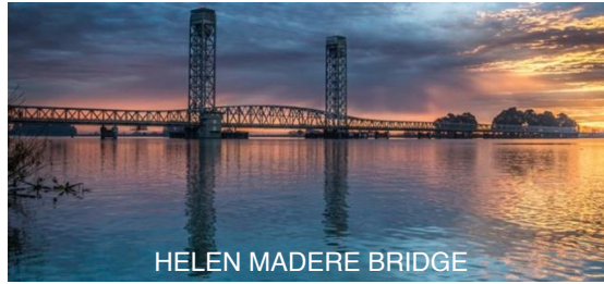
HELEN MADERE BRIDGE

CARDIOLOGIST'S DIET: If it tastes good, spit it out.