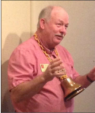
Look Ma, no hands! Our Pres. chains bell around neck for safe keeping.