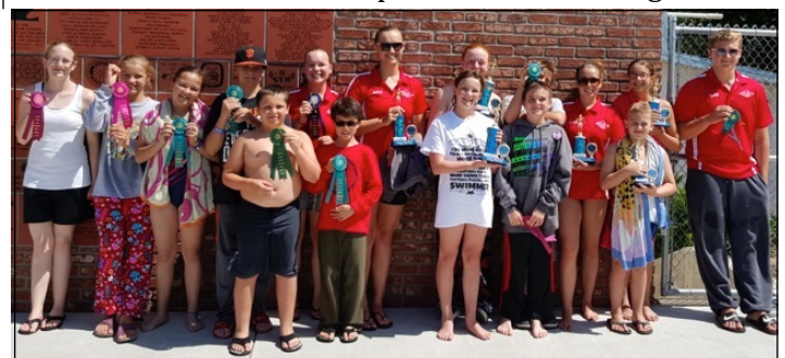
Sharks sell $1,000 of ball drop tickets. These winners show awards following Rotary Pentathlon, Saturday.

Eddie's ticket is not helpful, he draws wrong marble.