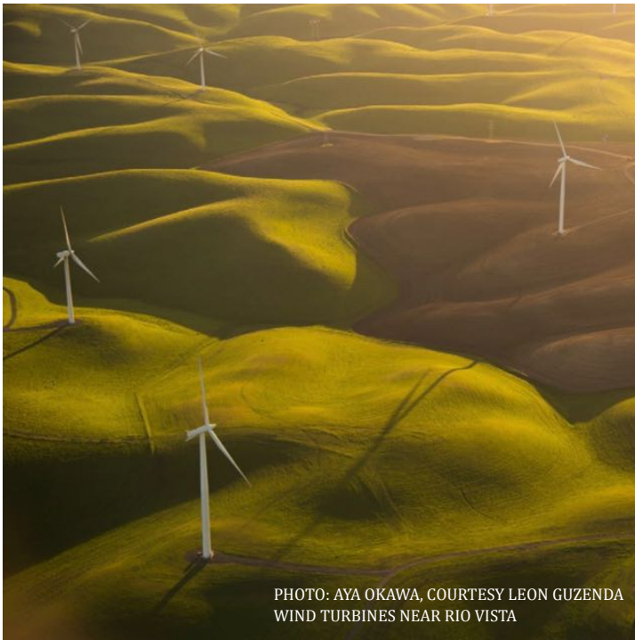
WIND TURBINES NEAR RIO VISTA