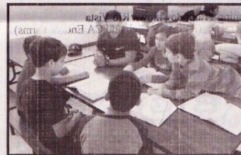
Coast Guard member working with the youngsters