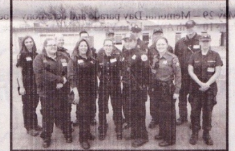
Members of the local Coast Guard, firefighters, police, C. H. P., and sheriff's departments