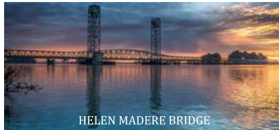
HELEN MADERE BRIDGE