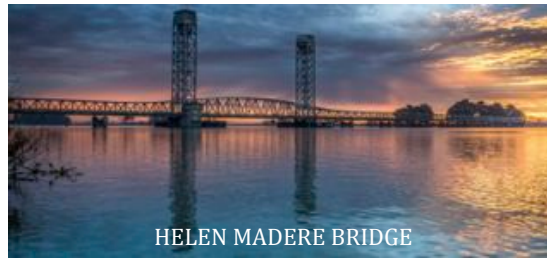
HELEN MADERE BRIDGE