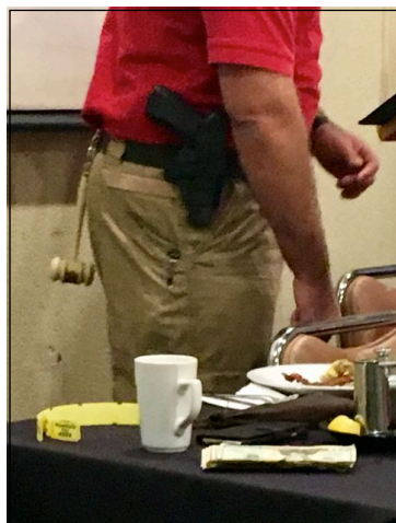
Packing heat and a stun gavel to keep us all safe!