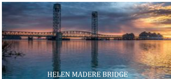
HELEN MADERE BRIDGE